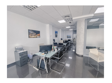
Price: 495,000 € M² Plot Size:

Bathrooms: 1M² Build size: 180Property Type: CommercialParking places: by request