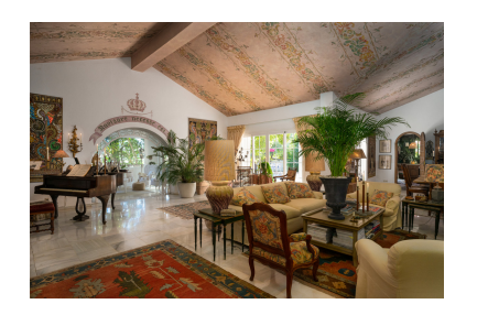
Price: 1,895,000 € M² Plot Size: 1,200

M<sup>2</sup> Build size: 265 Parking places: by request