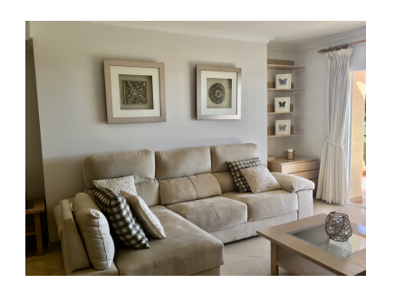
Price: 540,000 € M² Plot Size:

M<sup>2</sup> Build size: 160 Parking places: by request