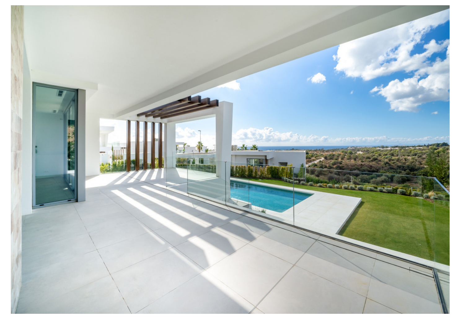
Bedrooms: 4 Status: Sale

Bathrooms: by request Property Type: Villa