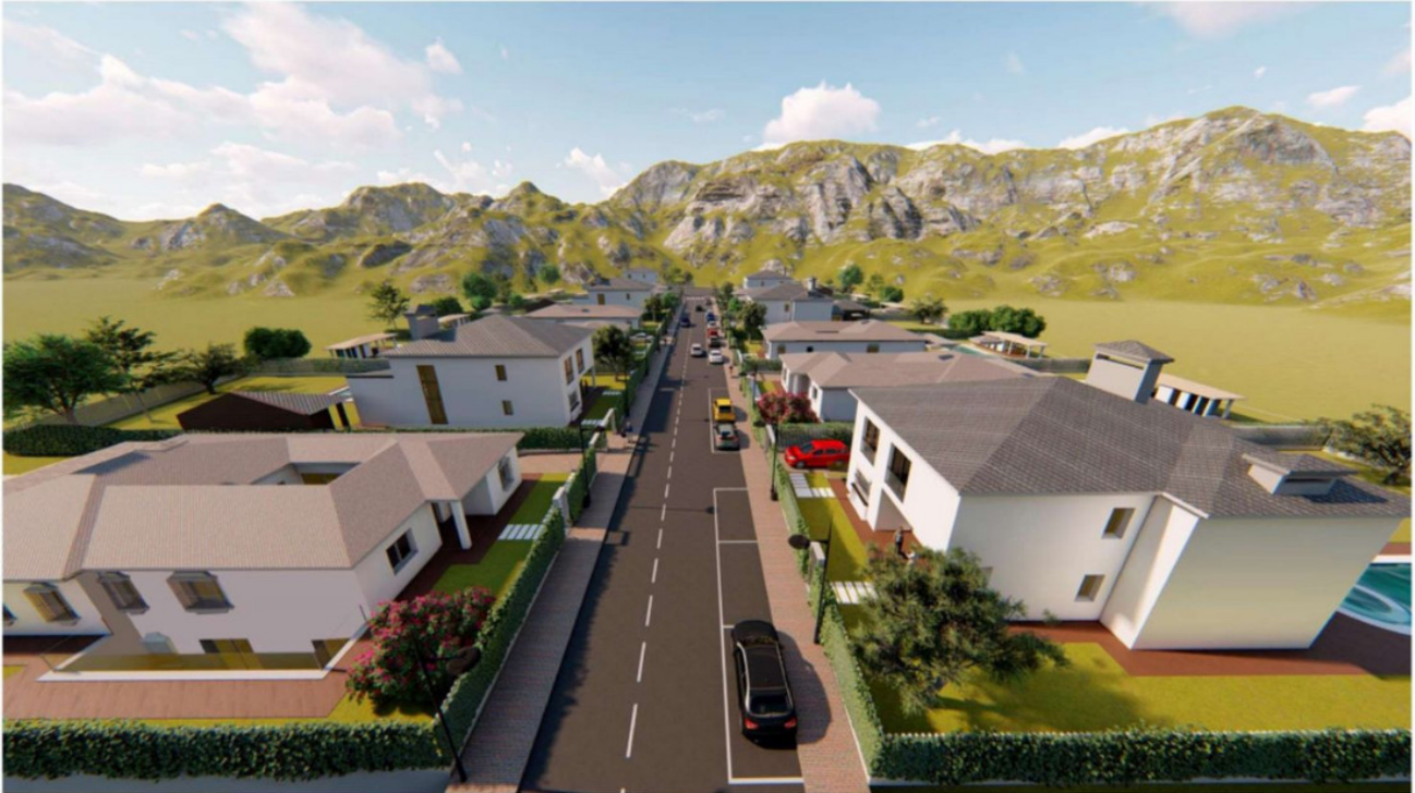
Ejemplo de barrio, zona este