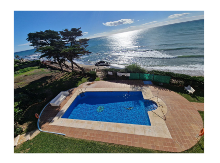
Price: 249,000 € M² Plot Size:

M<sup>2</sup> Build size: 39 Parking places: by request