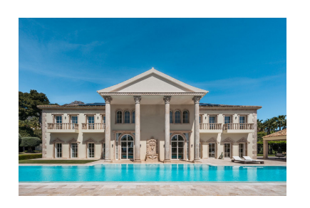
Price: 16,000,000 € M<sup>2</sup> Plot Size: 4,000

M<sup>2</sup> Build size: 2,000 Parking places: by request