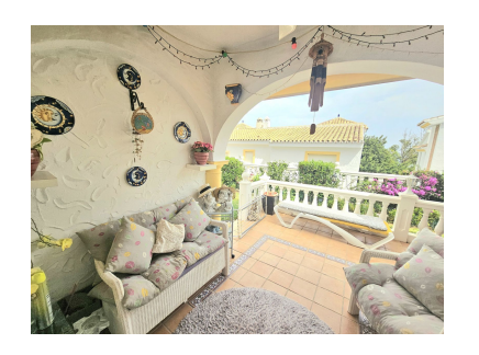
Price: 399,000 € M<sup>2</sup> Plot Size: 110

M<sup>2</sup> Build size: 111 Parking places: by request