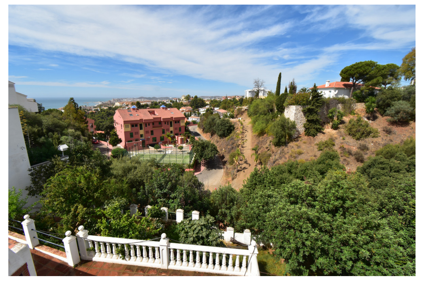
Спальни: 5 Статус: Продажа

Ванные: 2 М² Размер: 280 Тип недвижимости: Вилла Места: по запросу