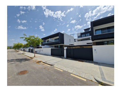
Цена: 795 000 € М² Участок:

Ванные: по запросу М<sup>2</sup> Размер: 112 Тип недвижимости: Вилла Места: по запросу